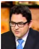
Minister of State for Legal and Parliamentary Affairs