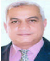
Minister of Agriculture and Lands Cultivation