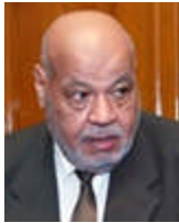
Minister of Justice

Has served as Deputy Minister of Interior and Director of the Public Security Authority