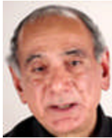
Minister of Housing

An engineering professor responsible for the educational policy of Morsi's presidential campaign.