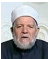
Minister of Awqaf

Secretary General of the Commission's legitimate rights and reform and the Under-Madinah International University in Malaysia and holds a doctorate in chemical engineering as well as Islamic law. He also served as Chairman of the Dawn Center to teach Arabic to non-native speakers at the Ministry of Education.