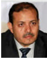
Minister of Media

Ex-president of the Cassation Court and one of the leaders of the judicial independence movement in Egypt and the former chairman of the fact-finding Committee in the Judges Club.