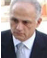
Minister of Higher Education

Professor at Faculty of Medicine at Cairo University.