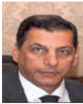
Minister of Interior