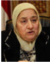
Minister of Insurance and Social Affairs

Urban planning professional and economics expert.