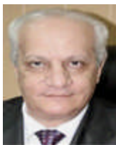
Minister of State for Antiquities Affairs

He obtained his Ph.D. in agricultural sciences (plant pathology) from the University of Texas in the United States U.S. He was previously the president of the Institute of Plant Pathology Research, and Deputy Head of the Agricultural Research Centre.