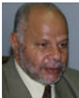
Minister of Irrigation and Water Resources

Served in this post Insurance & Social Affairs Minister) in the interim government. Previously the General Manager of the National Center for Social and Criminological Research. She has also conducted research on a number of concerns and interests of Egyptian citizens.