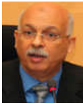
Minister of Health & Population